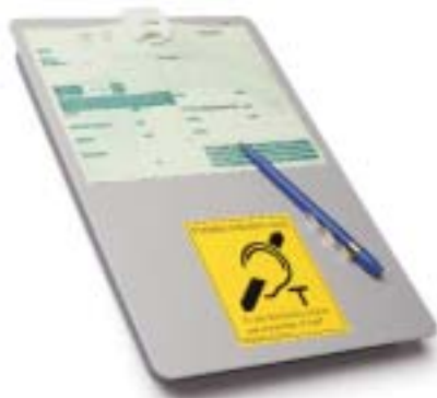
The highly portable Clipboard InfoLoop™ features sophisticated electronic circuitry to ensure the best possible voice reproduction. Automatic standby mode conserves battery life

The Power Supply Unit connects to any convenient mains outlet to re-charge the Clipboard InfoLoop™.