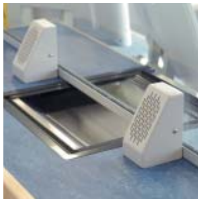
Police stations use SecuriCom™ to enhance staff security