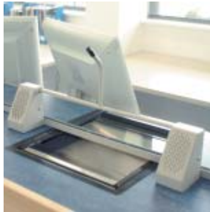
In noisy ticket offices, SecuriCom™ exceptional voice reproduction system helps speed up transactions