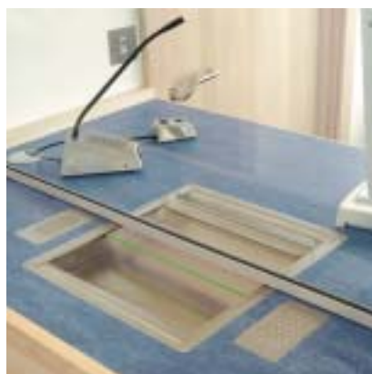
Flush-mounted SecuriCom™ enables clear communication and complements high specification finishes